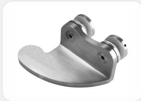
Glass Right Door Pivot