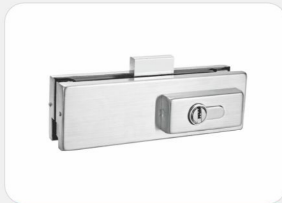
Glass Bottom Lock