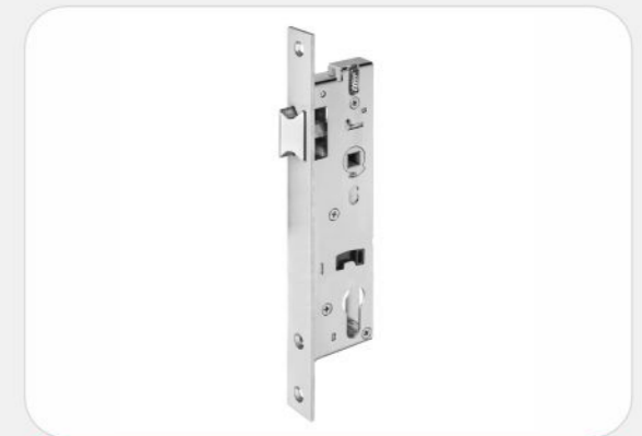
Mortise Lock Body