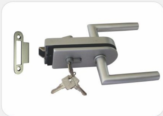
Glass Door Studio Lock