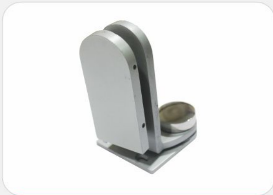
Glass Door Hinges (Top, Bottom)