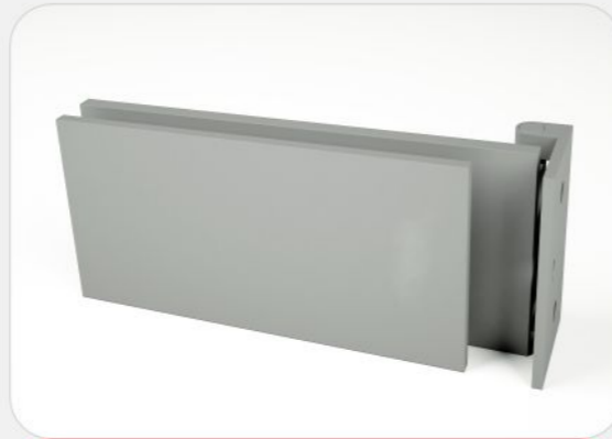
Glass Door Hinges (Square)