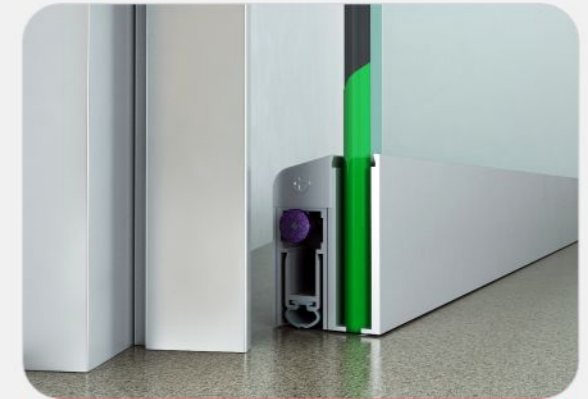
Drop Down Seal