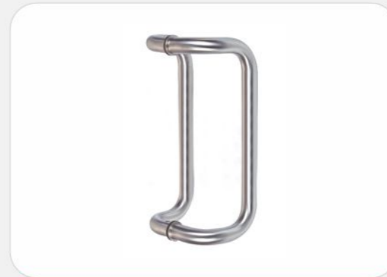
Glass Door Handle