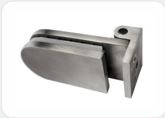
Glass Door Hinges (Round)