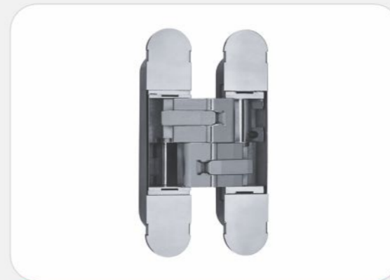
3D Concealed Hinges