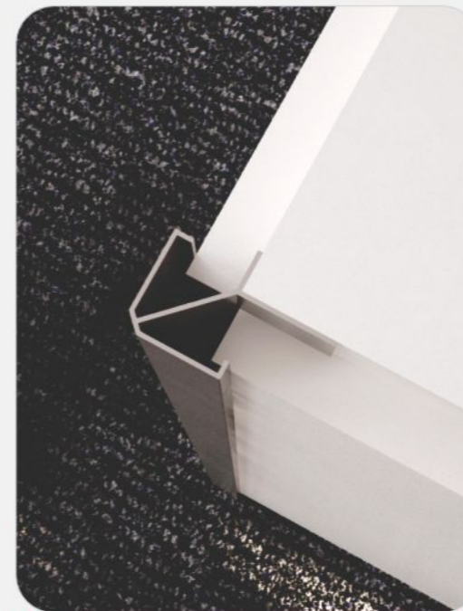
Edge Extension Corner